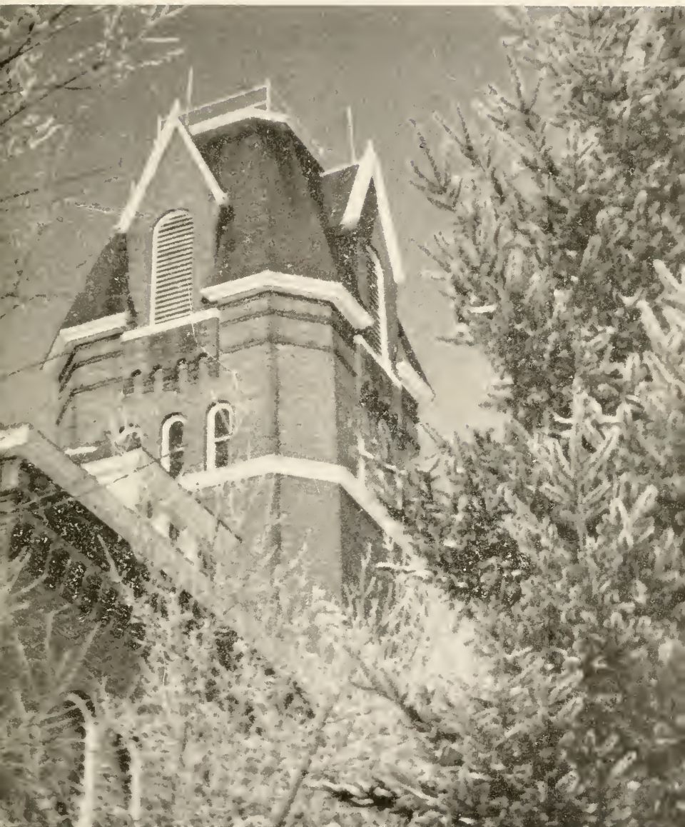
"... TOWER SEEN FAR DISTANT"